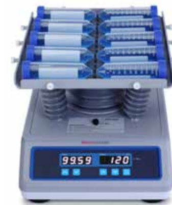
Digital Waving Rotator shown with Thermo Scientific™ Nunc™ Test Tubes on a Thermo Scientific Rubber Mat. Nunc Test Tubes sold separately.

Includes Dimpled Rubber Mat (88882102), Rubber Strips (88882103, 6/Pack). Use optional Rubber Mat (88882101) for plates, dishes, culture bottles, and bags. Warranty: 2 years | Certifications: CE