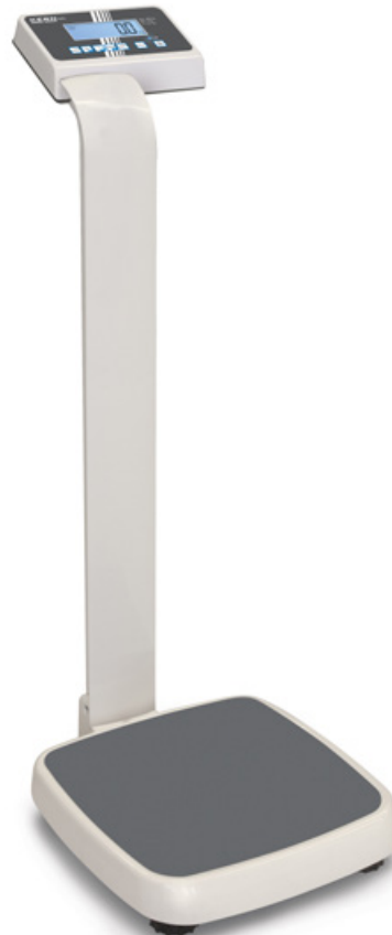
KERN MPE-P with stand