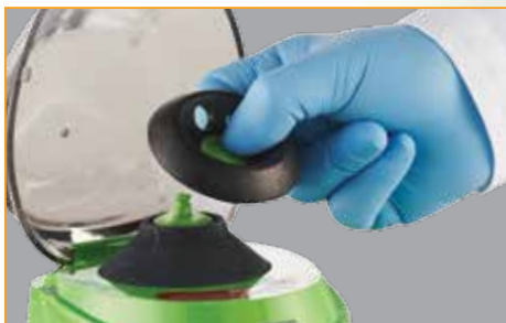
Change out rotors with the push of a button