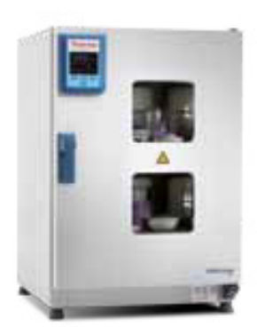
viewing windows in 180L Unit

*maximum temperature for ovens with view package is 250 °C