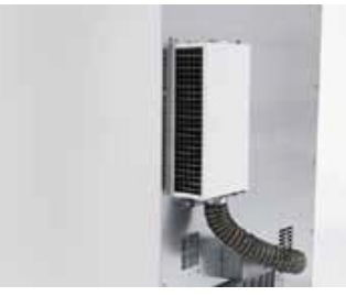
Fresh air particle filter