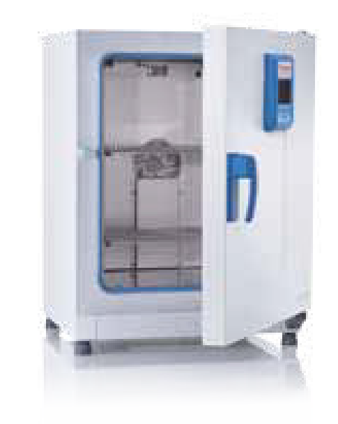
All Heratherm Advanced Protocol Security ovens are available in coated or stainless steel exterior. (model 100 L shown)