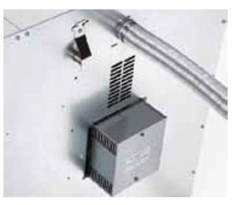
Underbench installation kit

Custom solutions available for table top ovens cable testing applications, clean room applications, and inner casing with conditional gas-tightness for inert gas applications. Access ports can be provided for large capacity ovens at preferred positions