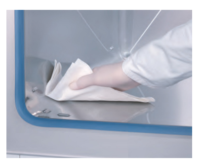
Smooth inner chamber with easy to clean rounded corners

Heratherm General Protocol Ovens, 60 L, 100 L, 180 L models