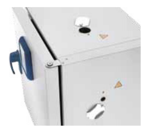
Additonal access ports top and right