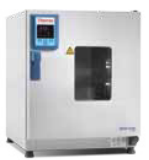
Viewing window in 100L unit