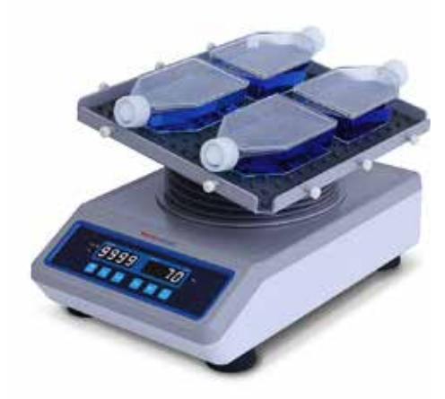
Digital Rocker shown with flasks on top of a Thermo Scientific Dimpled Rubber Mat. Flasks sold separately.