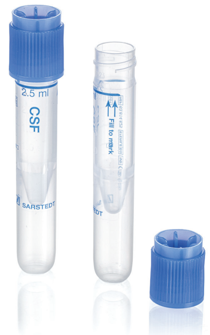
CSF false-bottom tubes

The new CSF false-bottom tubes create the perfect conditions for reliable pre-analytics to support the current development in research, diagnostics and treatment of Alzheimer’s disease.