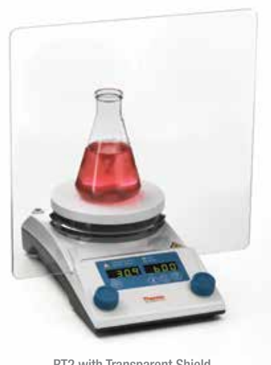
RT2 with Transparent Shield