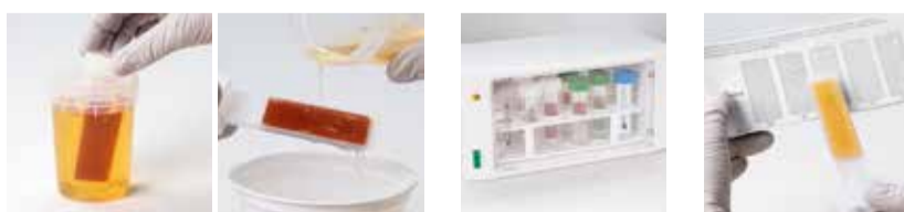
Dip or pour